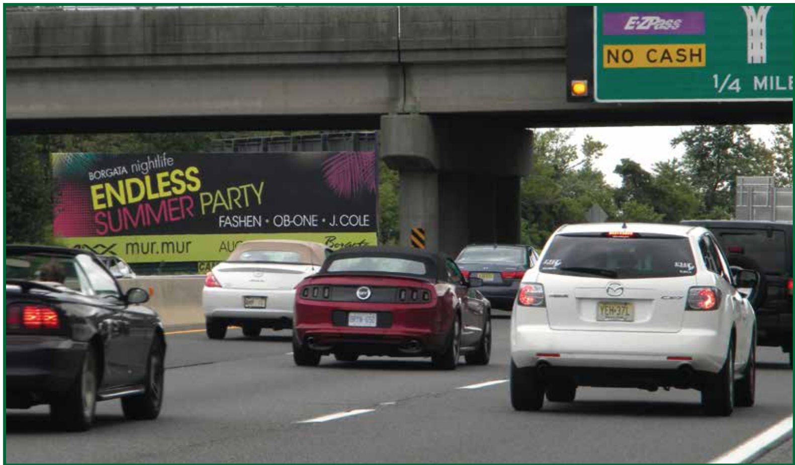
Static Bulletin Display