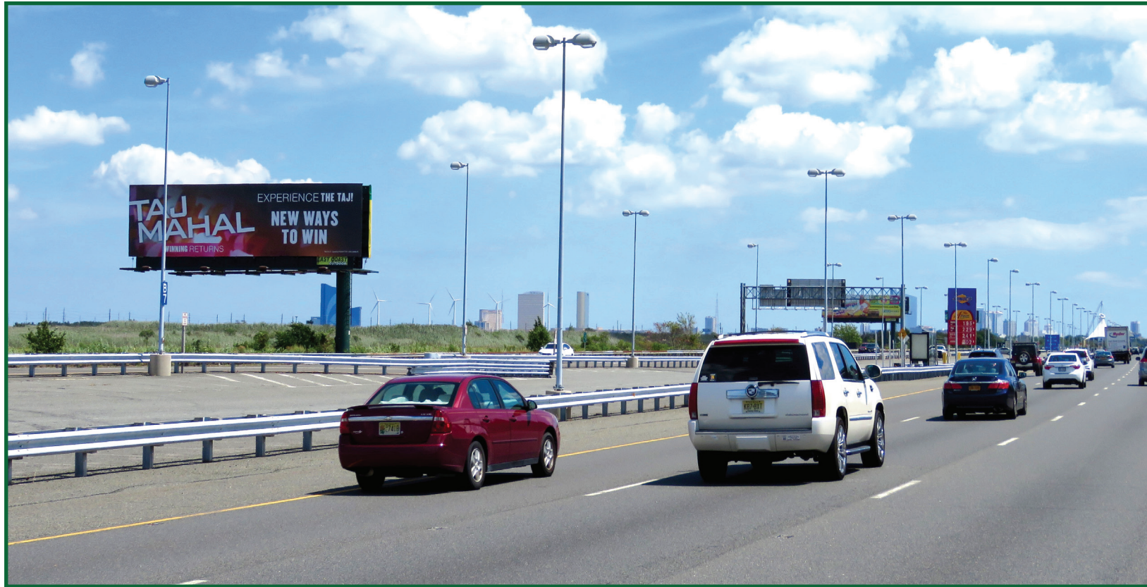
Static Bulletin Display